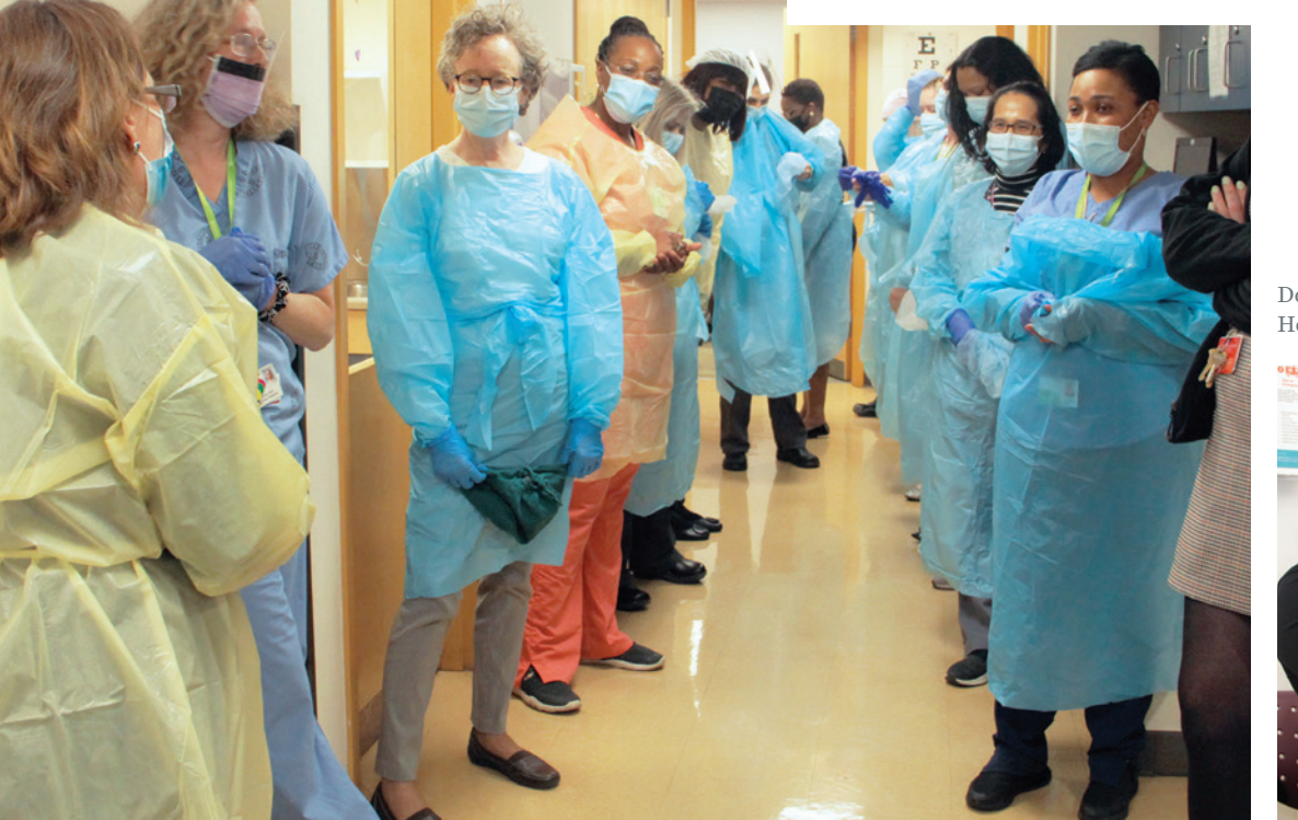
DotHouse Health committs to being a Health Center Quality Leader in Dorchester

More information on Health Centers' data can found at: 2020 Uniform Data System (UDS) Data.